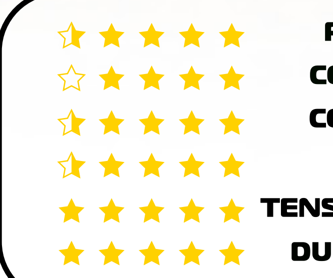
POWER CONTROL CONFORT SPIN TENSION MAINT DURABILITY